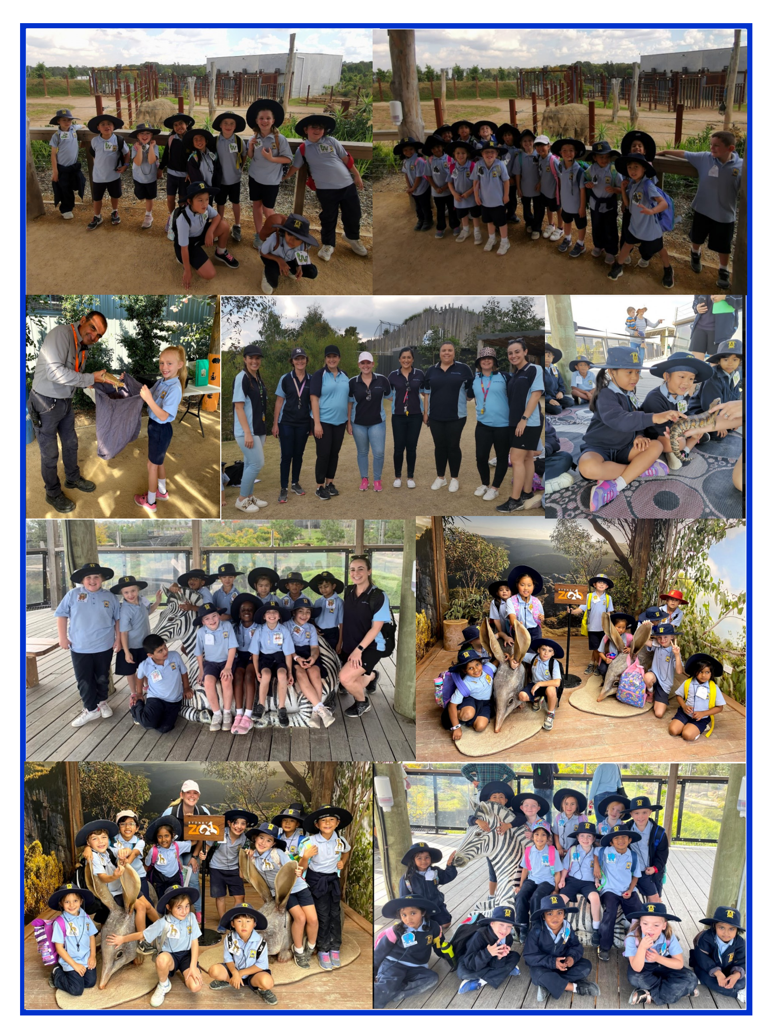
Truth Through Learning