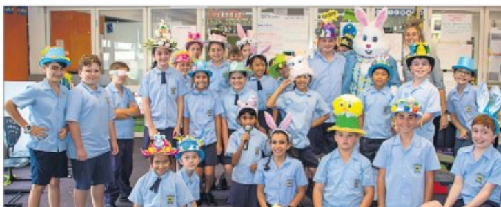
Students from St Nicholas of Myra in Penrith at their Easter Hat Parade last week.

Kindergarten children had actual Easter eggs on them, and I think that brought back the sense of community for our families as well as home, doing something together," she said.